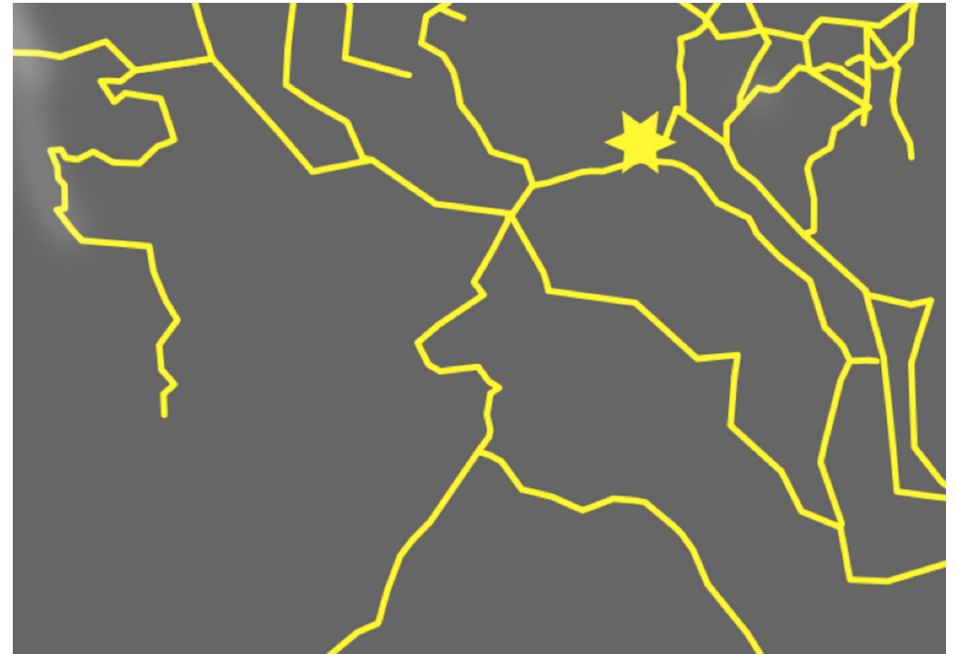
Figure 1. Stick map of the cave area. The entrance at Cenote Odyssey is marked by the star.

The deceased diver's equipment consisted of four aluminum 80 ft 3 tanks filled with 32% nitrox as marked on the cylinders and a Blacktip brand DPV. He was diving in sidemount gear configuration and with two stages.